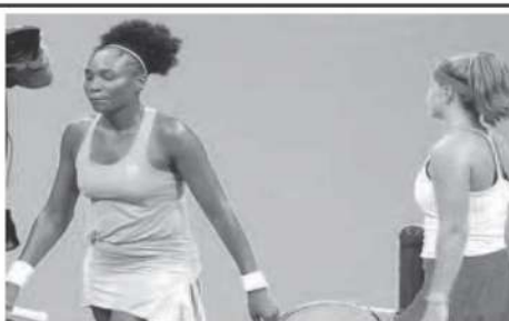
Venus Williams, of the United States, left, leaves the court along with Karolina Muchova of the Czech Republic, right, after their first round match at the U.S. Open tennis championships in New York. Muchova won the match.