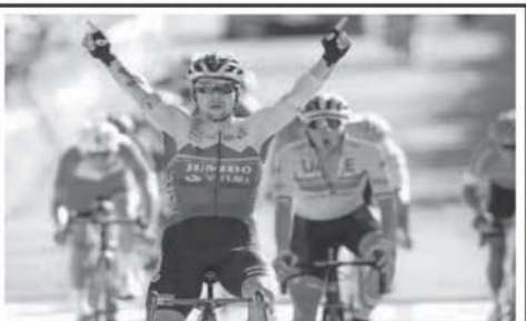
Slovenia's Primoz Roglic celebrates as he crosses the finish line to win the fourth stage of the Tour de France cycling race over 160.5 kilometers (99.7 miles) with start in Sisteron and finish in Orcieres-Merlette, southern France.