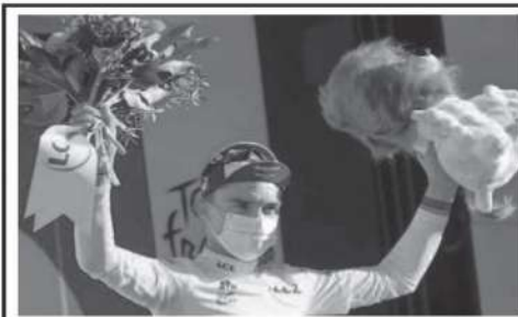
France's Julian Alaphilippe wears the yellow jersey of the overall leader on the podium after completing the fourth stage of the Tour de France cycling race over 160.5 kilometers (99.7 miles) with start in Sisteron and finish in Orcieres-Merlette, southern France.